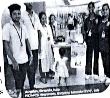
Mangaluru, Karnataka, India NSS Volunteers, Mangaluru, Karnataka, India

NSS Volunteers had helped Bunder PHC in giving Pulse Polio drops at City Centre and Forum