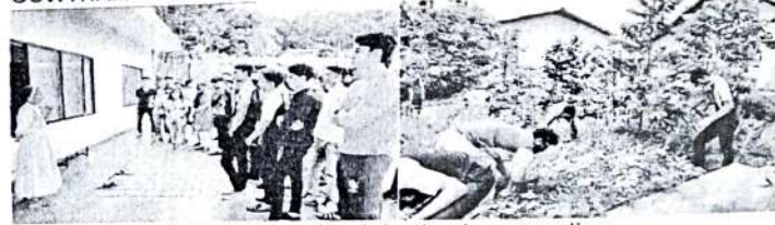
Students interacting with the staff and cleaning the surroundings

Mangaluru: The students of St. Aloysius College (Autonomous) visited De Merced Orphanage Pander Deralakatte last week as part of the college outreach program. At the children's home, the students inter-