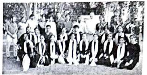
The cast along with Principal and faculty

Campus: Radio Sarang 107.8 FM, in collaboration with the department of Journalism, of St. Aloysius College (Autonomous), Mangaluru presented a street play in Mother Teresa Peace Park on 20 April 2022.