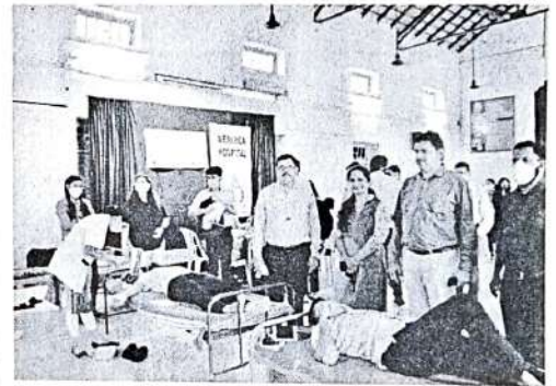
Students donating blood at the Blood Donation Camp