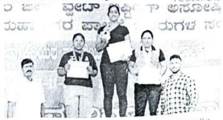
Success is nothing but a PHASE. A PHASE that doesn't stop till it reaches its goal.