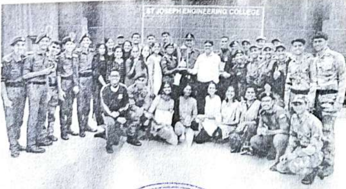
Success is always a sweet one despite the effort you put in it. Better one

NCC Air Wing cadets of St Aloysius College Autonomous, Mangaluru won over-all championship in the 10 days ATC camp held at Joseph Engineering College, Vamanajour