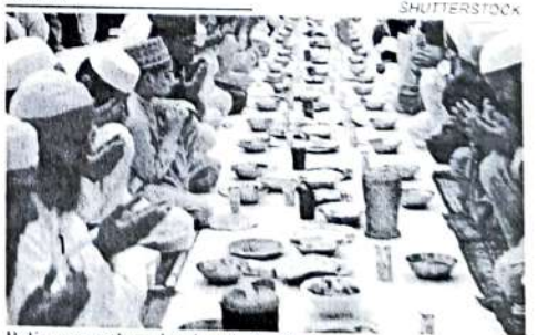
Believers gathered to break the fast

Mangaluru: Ramadan is considered the holy month of Islam. Ramadan, is the ninth month of the Muslim calendar and the holy month of fasting. It is a festival of love and togetherness. It begins and ends with the appearance of full moon.